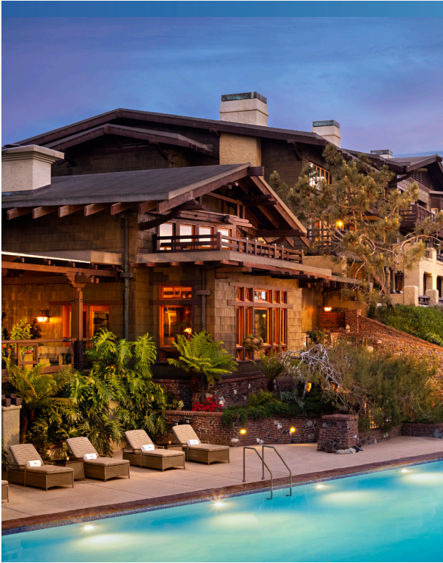
THE LODGE TORREY PINES®