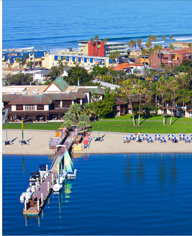
CATAMARAN RESORT HOTEL and Spa